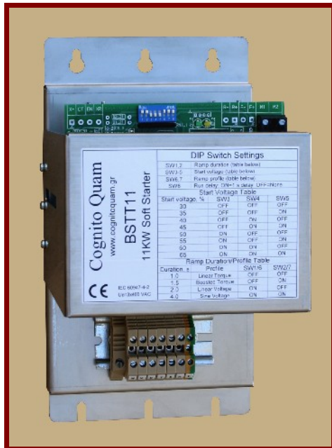
BSTT 11KW soft starter.

The BSxT soft starters accelerate and decelerate (BSFT only) simple AC induction motor loads smoothly, save energy and reduce system wear and tear.